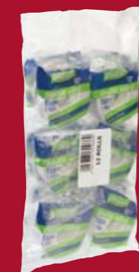
RT0203 15mm x 10m