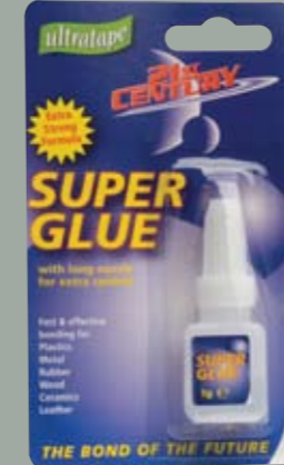
0595-5GM 5g Tube