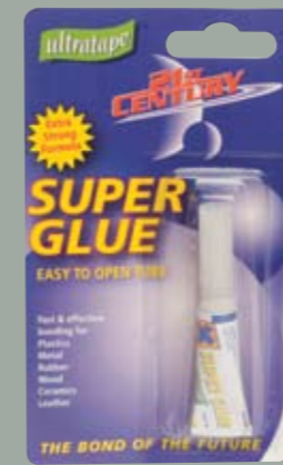
0595-2GM 2g Tube

These lines have been recently added to complement the range – Superglue in tube and bottle, Clear Glue and White Tack. Essential products with numerous uses around the office and home.