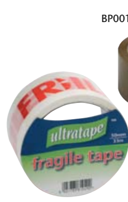
FRAG-UL1 50mm x 33m