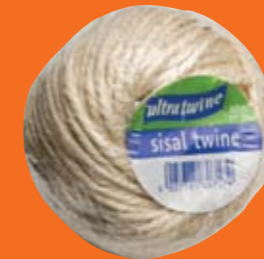
0200SISAL Value Ball – Sisal Twine