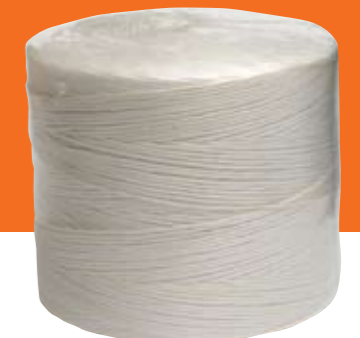
02004BC Ex Large Ball – Poly Twine