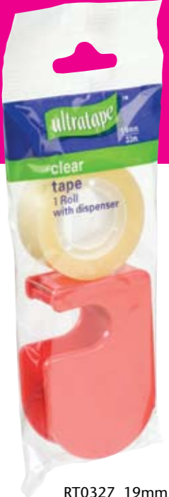
RT0327 19mm x 33m