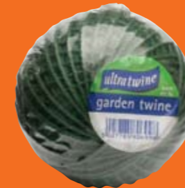
0200GRN Value Ball – Garden Twine