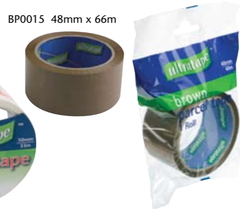
BP0015 48mm x 66m