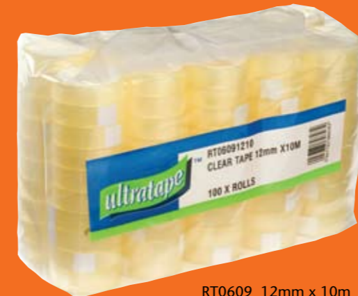
RT0609 12mm x 10m 100 Rolls per Inner