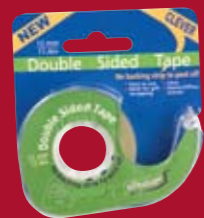
RT0970 12mm x 11.4m

As well as these Double Sided Tapes, we have our best selling General Purpose Tape, Sticky Foam Pads and Hook & Loop Pads.