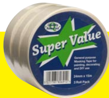
RT0710/3 24mm x 15m – 3 Pack