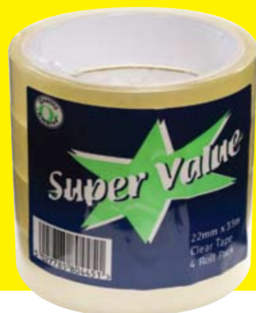
RT0308/4 22mm x 35m – 4 Pack