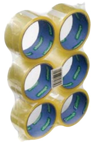
RT0390 48mm x 40m

We can supply in various pack sizes and packaging format to suit customer requirements.