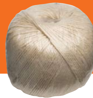
02002.5S Large Ball – Sisal