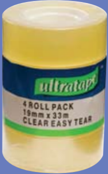
ET0014/4 19mm x 33m 4 Roll Pack