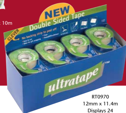
RT0970 12mm x 11.4m Displays 24