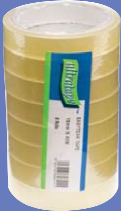
RT0420/8 18mm x 40m 8 Roll Pack