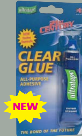
0595-20ML 20ml Tube