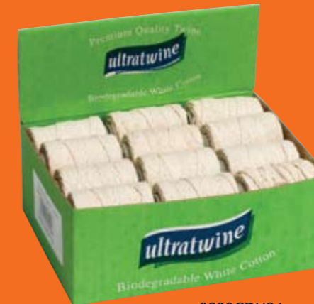
0200CDU24 Small Fine Spool