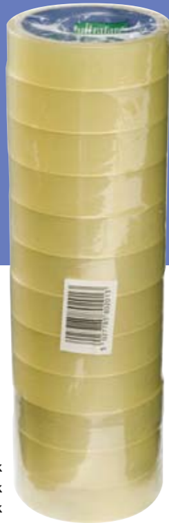
Sizes available RT0305 12mm x 40m – 24 Roll Pack RT0305 18mm x 40m – 16 Roll Pack RT0305 24mm x 40m – 12 Roll Pack