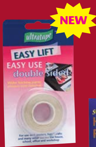
FL0105 15mm x 5m