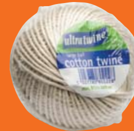
0200200 Value Ball – Cotton Twine