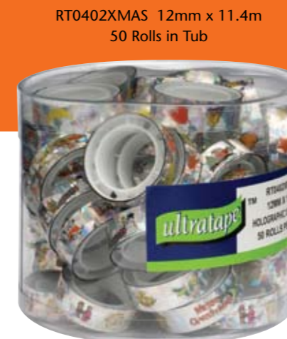
RT0402XMAS 12mm x 11.4m 50 Rolls in Tub