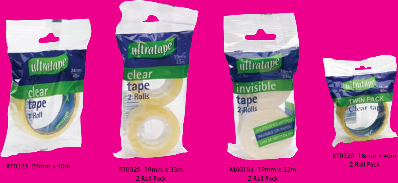
RT0323 24mm x 40m

This is the best quality of adhesive tape you can buy. Manufactured from cellulose film, it resists curling and is readily torn by hand. 12mm, 18mm, 24mm and 48mm widths Core size: 75mm & 25mm