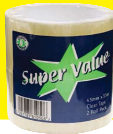
RT0308/2 45mm x 35m – 2 Pack

In the retail market , consumers make choices based on quality and value for money. Our consumer products are competitive on both counts.