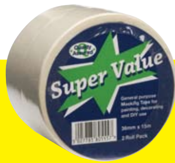
RT0710/2 36mm x 15m – 2 Pack