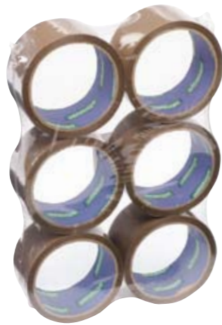
RT0301 48mm x 40m