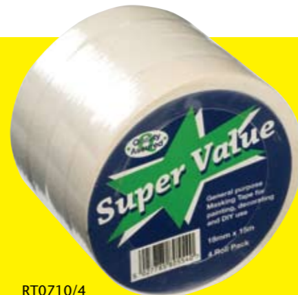
RT0710/4 18mm x 15m – 4 Pack