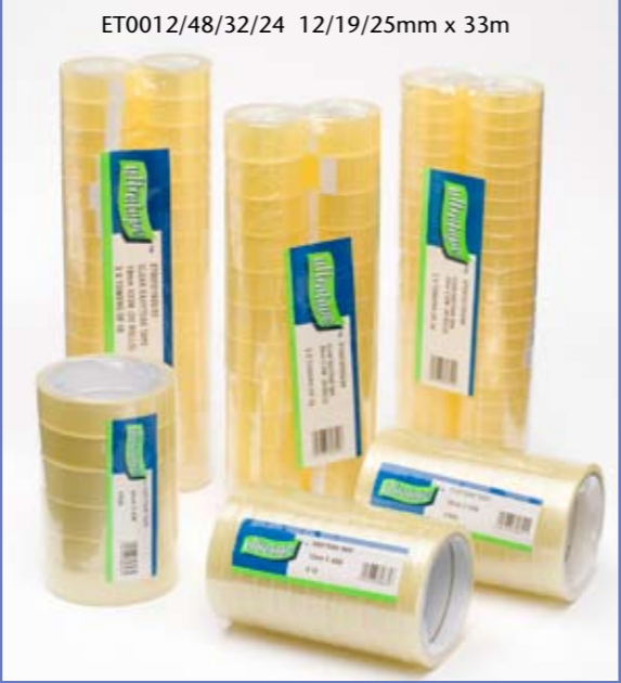
ET0012/48/32/24 12/19/25mm x 33m