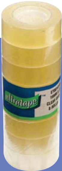
ET0014/8 19mm x 33m 8 Roll Pack