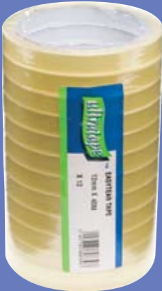
RT0430/12 12mm x 40m 12 Roll Pack