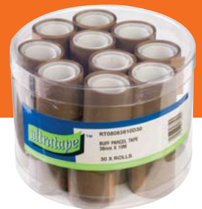
RT0808 38mm x 10m 30 Rolls in Tub