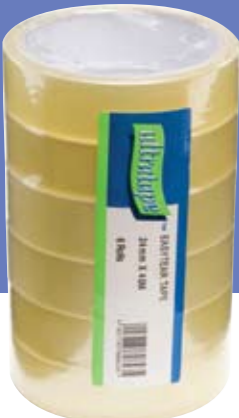
RT0430/6 24mm x 40m 6 Roll Pack