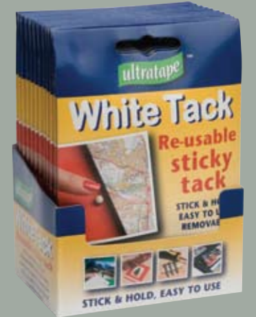
0491-UL 50gm Pack