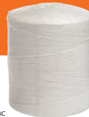
02002.25BC Large Ball – Poly Twine