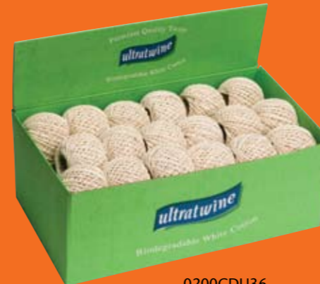
0200CDU36 Small Fine Ball

Also available from stock are large balls for own use bailing applications.