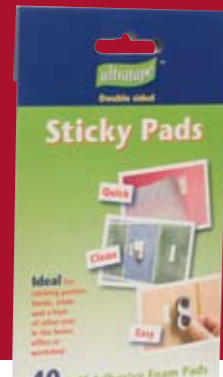
RT0202 40 Pads per pack