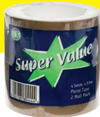
RT0301/2 45mm x 35m – 2 Pack