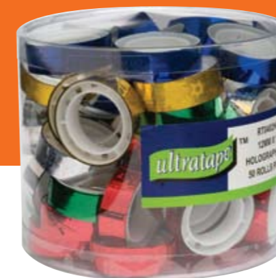
RT0402HOLO 12mm x 11.4m 50 Rolls in Tub

This selection of small rolls is the ideal solution where space is an issue. These products are particularly suitable for the CTN, card shop or convenience store. Available in Clear, Brown Parcel, Holographic Colours and Holographic Festive Designs.